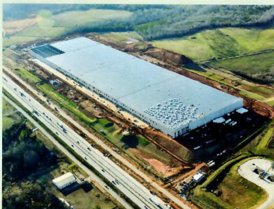
MANN + HUMMEL