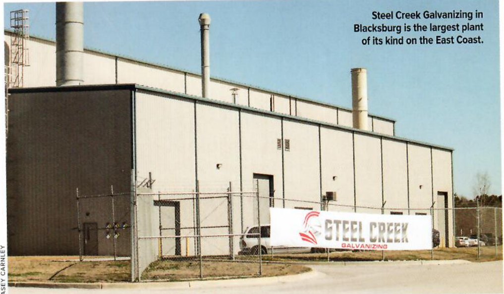
Steel Creek Galvanizing in Blacksburg is the largest plant of its kind on the East Coast.